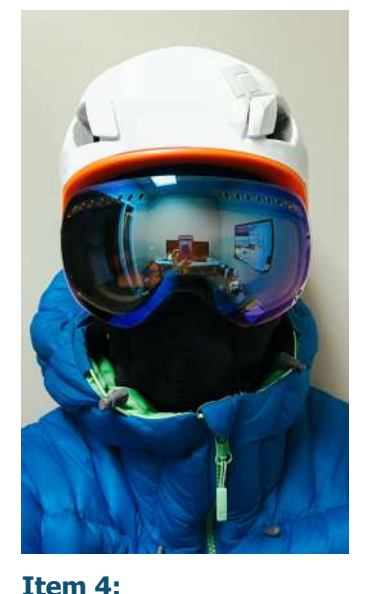
Balaclava or Face Mask Materials: Power Stretch Fleece or Windstopper

The face is especially vulnerable to cold injury and complete face protection is essential. Try combinations of balaclava, face mask, hat, and goggles together to ensure that there are no gaps—often a crescent shape between the edge of the goggle and a face mask or balaclava is hard to cover. You must be able to breathe freely and moisture from your breath must be able to escape (so that goggles do not fog).