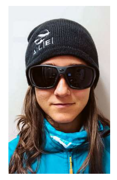
Item 1: Hat or Beanie that Covers Ears

You will need several options to cover your head, neck, and face (mouth and nose) depending on the temperature, wind conditions, and sun exposure.