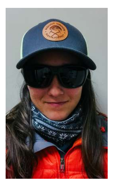
Item 2: Wide brim sun hat, baseball hat, or trucker hat