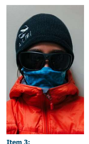
Neck Gaiter or Buff Materials: Fleece or Polyester Microfiber